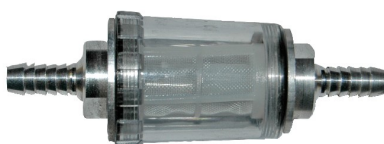
One way valve with filter screen suitable for installation before the main filter, available in 8mm and 10mm Can be disassembled and cleaned.