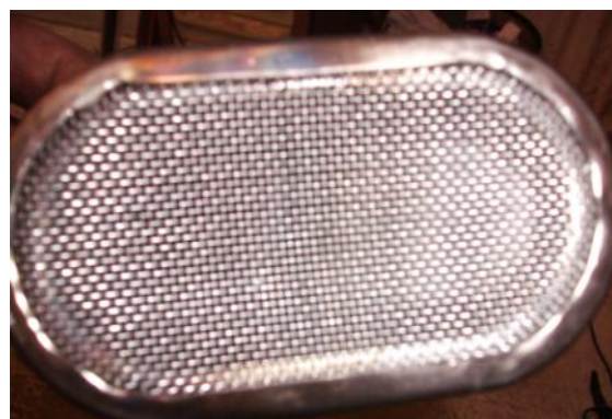
Clean oil pick up

If you suspect injector seat failure or your replacing the seals as above (see issue 12 for full details) the engine oil should be drained and an inspection of the oil pick screen made through the drain hole with a torch. If it's blocked, the sump should be removed and the screen cleaned to avoid imminent engine failure.