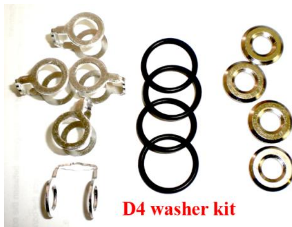
D4 washer kit

The first signs of injector seat failure, is white smoke and an engine misfire at first startup cold. When these symptoms become apparent the injectors should be removed and new seals fitted. We have seal kits in stock