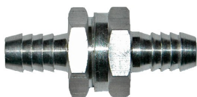
Alloy one way valves available in 8mm — 10mm and 13mm These valves should only be fitted after the main filter too prevent dirt entering valve.