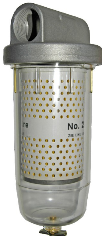
Bulk tank filter with drain