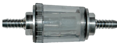
One way valve with filter screen suitable for installation before the main filter, available in 8mm and 10mm Can be disassembled and cleaned.