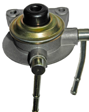
Replacement Toyota filter head